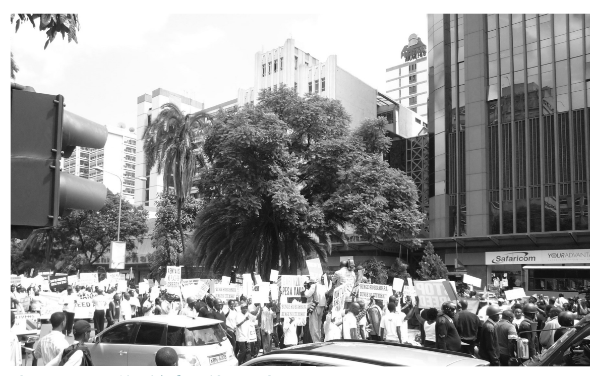
Demonstration in Nairobi's Central Business District.

A number of HRDs have indicated to us that their constitutional rights of freedom of expression and peaceful assembly have not always been guaranteed. People have been prevented from holding demonstrations or protests and sometimes are arrested in the morning on the day of a planned protest - to be released without charge in the evening after the protest- ostensibly to stop them from taking part in the demonstration. In addition, HRDs are regularly arrested during peaceful demonstrations.